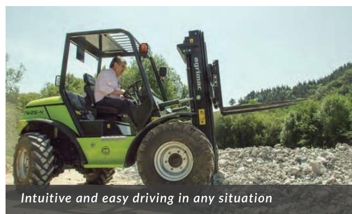
Intuitive and easy driving in any situation