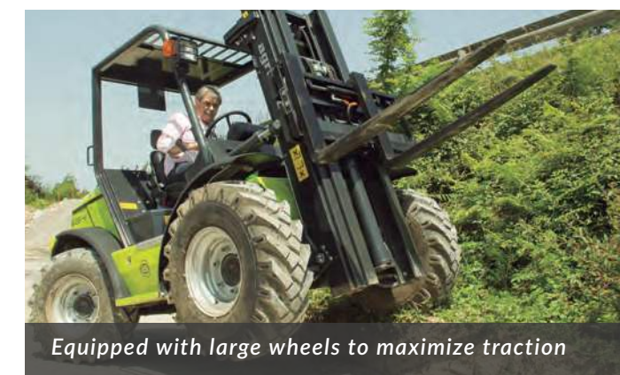
Equipped with large wheels to maximize traction